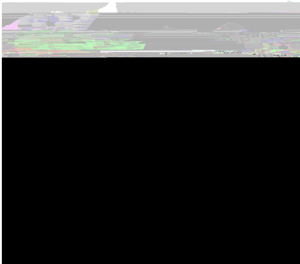
Figure 1 - Areas of control as of December 13, 2017. Arrows indicate advances made during the reporting period.

A political standoff is due to come to a head in the opposition-held Idleb pocket with the HTS-backed Salvation Government calling for the rival Syrian Interim Government (SIG) to vacate all offices by Friday, December 15. The SIG has called on units affiliated with the Free Syrian Army to protect SIG personnel and offices. Elsewhere, ISIS forces in eastern Hama governorate significantly expanded their territorial control, capturing at least seven small towns from HTS, briefly entering the administrative border of Idleb governorate before being pushed back by an HTS counteroffensive. ISIS advances in the area have benefitted from heavy Russian and government aerial bombardment of opposition forces as well as a simultaneous government offensive 15km to the west of ISIS positions. Government troop movements in the area are poised for a major offensive most likely in an effort to take the Abu Dhuhur air base and gain control over the Hama-Aleppo highway.