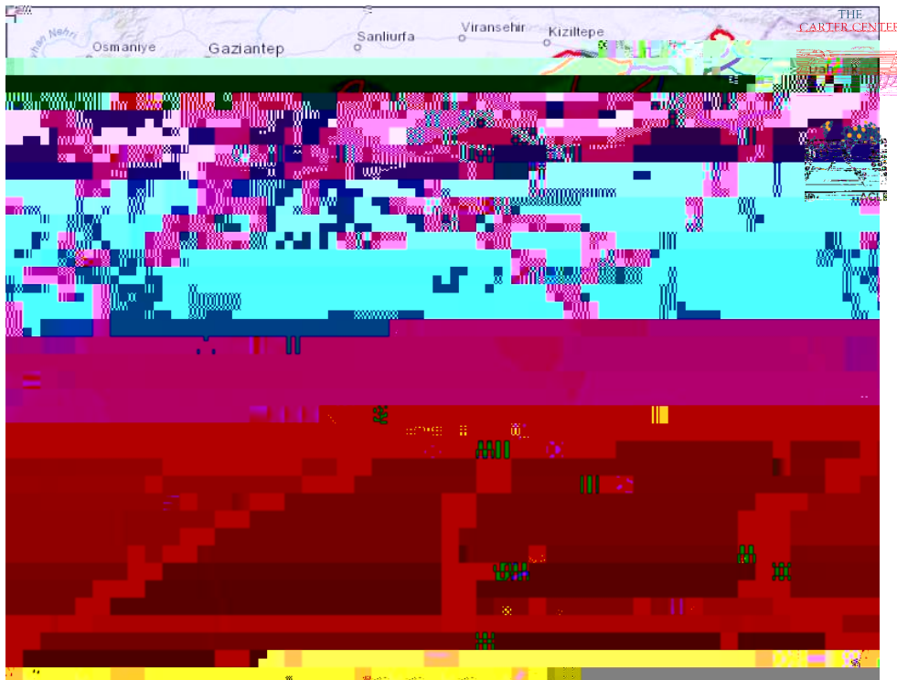
Figure 1: Dominant actors' area of control and influence in Syria as of 31 December 2021. NSOAG stands for Non-state Organized Armed Groups. Also, please see footnote 1.