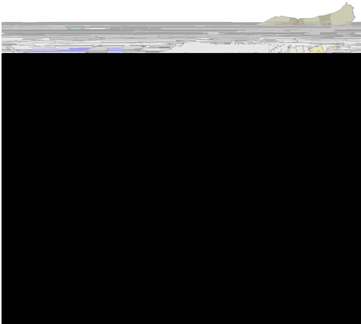
Figure 1 - Areas of control in Syria by May 31, with arrows indicating advances since the start of the reporting period. The underlying map is shaded based upon the density of population centers, with darker areas indicating greater density.

Over the course of this reporting period, ISIS has continued to lose large swathes of territory, especially to the Kurdish-led Syrian Democratic Forces (SDF) and pro-government forces. Conflict around Daraa city and pro-government offensives are slated to start. Intra-opposition strife continued in Aleppo province and in Rural Damascus.