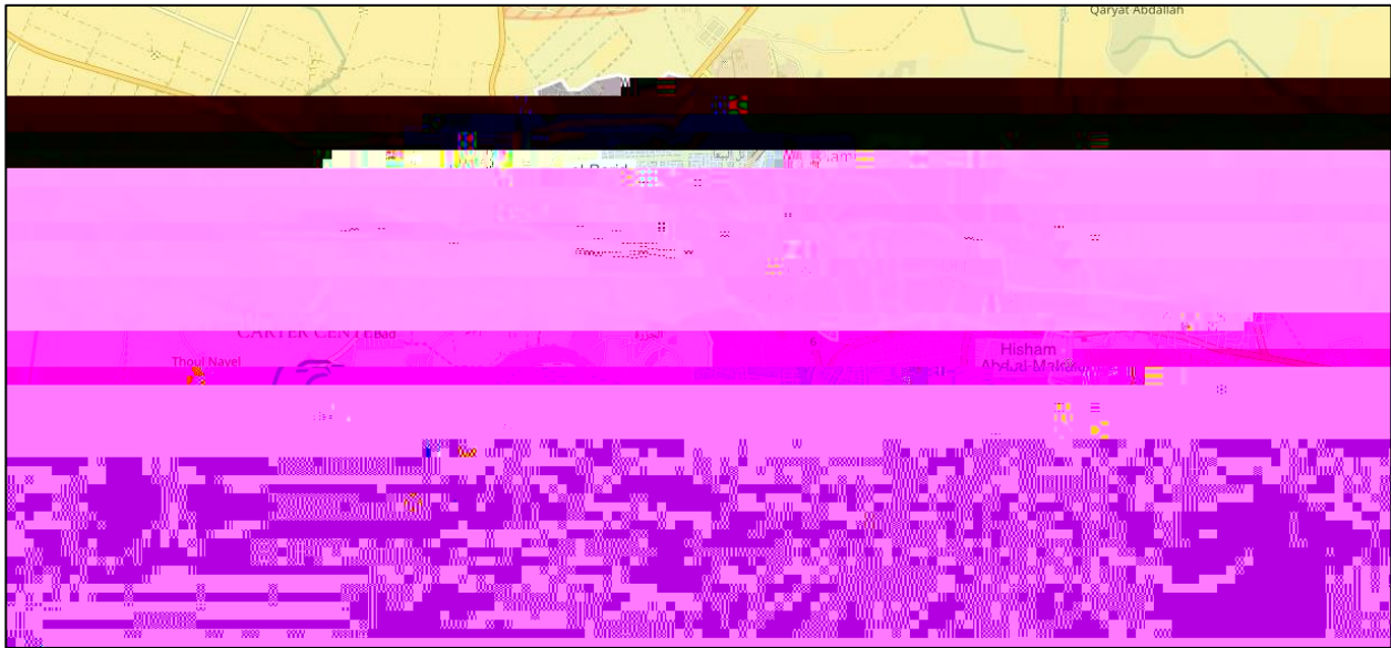
Figure 2 - Frontlines around Raqqa city by July 5

adjacent to the city center, where most of the ISIS forces defending Raqqa are located.