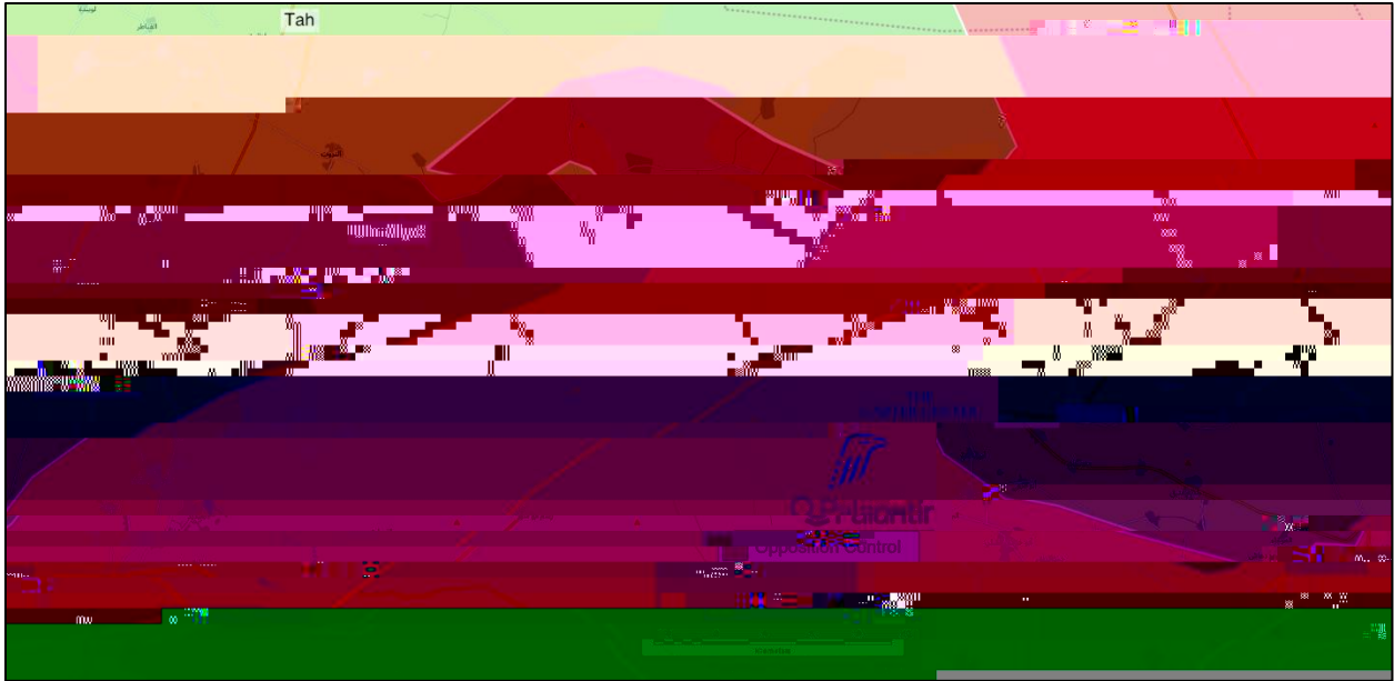
Figure 3 - Frontlines at the southeastern border of the opposition-held Idleb pocket by October 18

During the previous reporting period, Hai'yat Tahrir al-Sham (HTS, formerly Jabhat al-Nusra) lost significant territory to a surprise ISIS offensive. This ISIS advance on October 9 created a temporary ISIS-controlled pocket in northeast Hama. HTS halted and reversed the ISIS advance with a counter-offensive involving the use of artillery, armored vehicles, and suicide attacks. The HTS counter-offensive is most active from the west end of the ISIS "pocket" and has so far captured a little less than half of the towns lost in the initial ISIS attack. HTS has so far recaptured Um Miyal, Abu Kahf, Abu al-Ghar, Rahjan, and Mustarihah, and Northern and Southern Sarha.