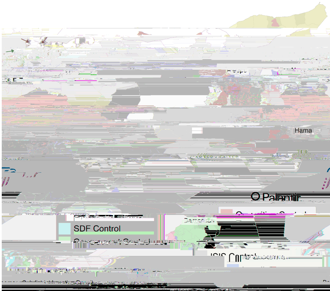
Figure 1 - Areas of control in Syria by March 7, with arrows indicating fronts of advances during the reporting period

bombardment of Eastern Ghouta continues, despite ceasefire attempts and UN Security Council Resolution 2401. Humanitarian aid deliveries have been repeatedly hindered by continuous violence, and have only delivered a fraction of the food and medical supplies agreed upon by all parties. The Turkish-led Operation Olive Branch achieved new gains during this reporting period. Turkish and allied opposition forces have pushed towards the city of Afrin from both the north and south, forcing the US and its Kurdish allies to declare a halt to ground operations against ISIS in eastern Syria.