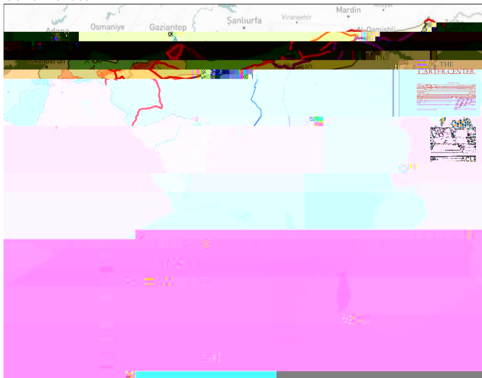
Figure 1: Dominant actors' area of control and influence in Syria as of 28 March 2021.-NSOAG stands for Non-state Organized Armed Groups. Also, please see footnote 1.

The predominantly Kurdish Syrian Democratic Forces (SDF) began a security campaign to arrest ISIS operatives in Al-Hol Camp, Al-Hassakah Governorate.