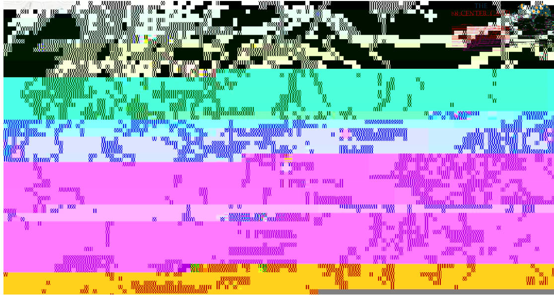
Figure 2: Armed clashes in northwest Syria since the 5 March ceasefire. Largest bubble is 12 conflict events. Data from ACLED and The Carter Center.